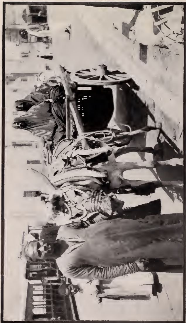
Ladies of the harem out for a ride